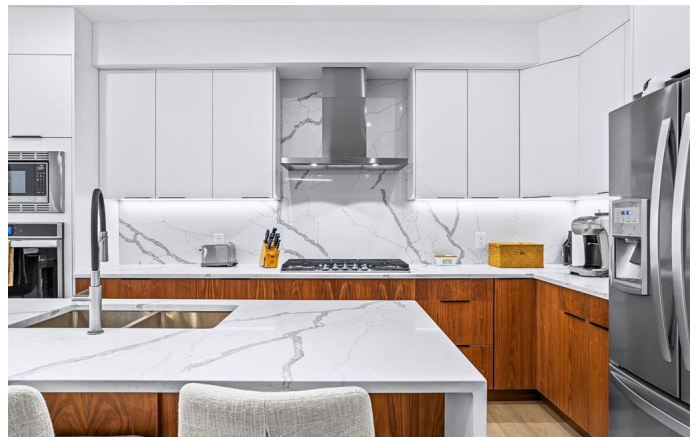
THE CHEF-INSPIRED KITCHEN IS AN ABSOLUTE SHOWSTOPPER