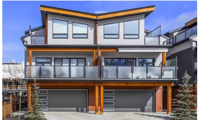
WELCOME TO UNIT 1 AT 826 7TH STREET IN CANMORE ALBERTA

With four spacious bedrooms and four luxurious bathrooms, this home is designed for comfort and convenience. Three of the bedrooms feature their own ensuites, ensuring privacy and luxury for each resident or guest. Whether you're waking up to a mountain