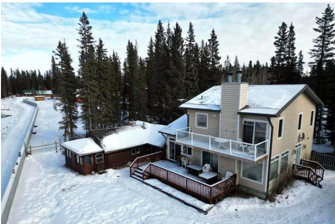
35 RIVER DR N, BRAGG CREEK (MAIN) - 01.20.2025

MAIN 1,098.61 SQ.FT./ 102.06 M2 UPPER 789.63 SQ.FT./ 73.36 M2 RHS AREA 1,888.24 SQ.FT./ 175.42 M2