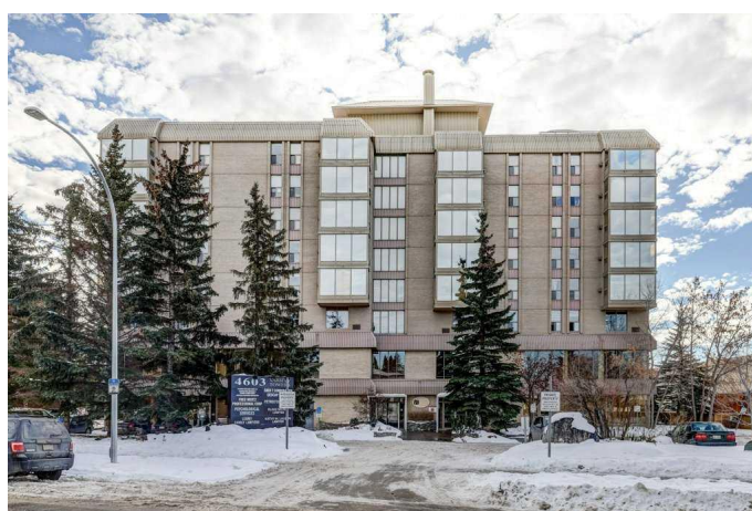
204-4063 Varsity Dr NW, Calgary, AB