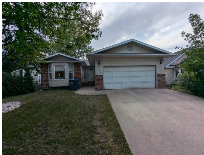
133 6 Ave SE, Three Hills, AB

This home is walking distance to down town and so close to the school and playground you can watch the kids walk all the way. Welcome home! Enter into a smart front entry layout, with the attached front garage entrance and front entrance side by side into the large living room with attached formal dining room, loads of natural light through recently updated triple pane vinyl windows. The kitchen boasts custom oak cabinets, double floor to ceiling pantry, an island with barstool height seating, recent appliances and a step down to a second dining space, perfect for a breakfast nook, home office, informal dining or other cozy space with a beautiful stone wood fireplace. The main floor living space has a large primary, with a large bay window, walk in closet and 3 piece ensuite, 2 more bedrooms, and a full bath plus main floor laundry-front load. The fully finished basement is spacious, with a bedroom, den, a family room with gas fireplace a large rec space, storage and cold room! Step outside to a fully fenced yard and deck, a 12 x 20 storage