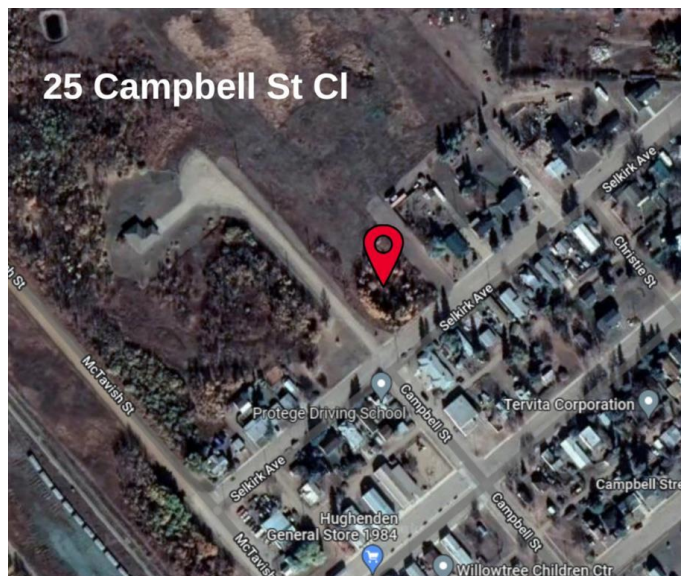
25 Campbell St Cl